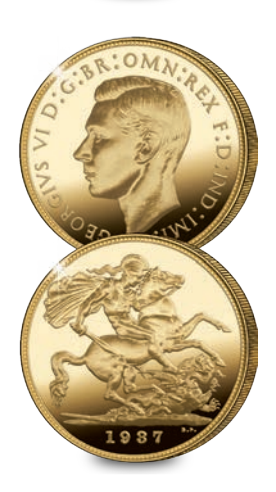
1937 George VI

Sovereign production reached its global height under George V, with coins struck in London, Perth, Melbourne, Sydney, Ottawa, Pretoria and Bombay. However, the Great War and general economic struggles led to Sovereign production being scaled back towards the end of George V's reign. It is still possible however, to assemble a complete collection of year dates using Sovereigns from the various branch mints right up until production ceased completely in 1932.