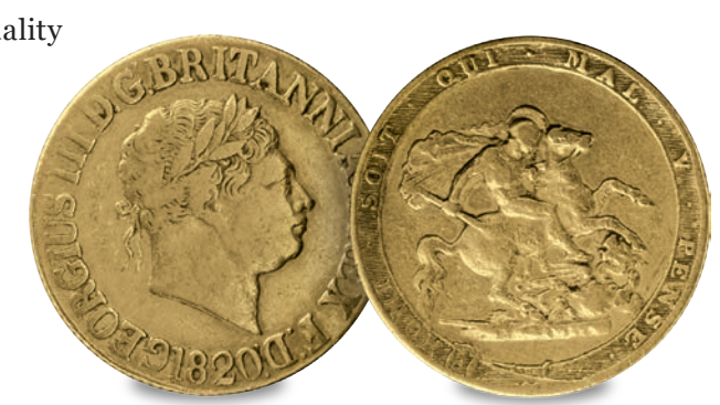
The 1820 George III Gold Sovereign

the sort of timeless quality that is achieved once in a lifetime, and the fact that it is still used and recognised around the world today, 200 years on, is testament to its brilliance.